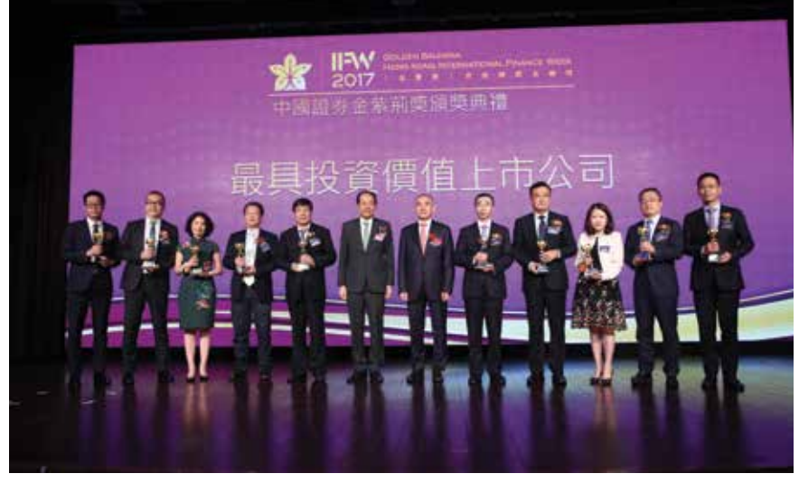
Group photo with the 'Listed Companies of Most Investment Value' awardees