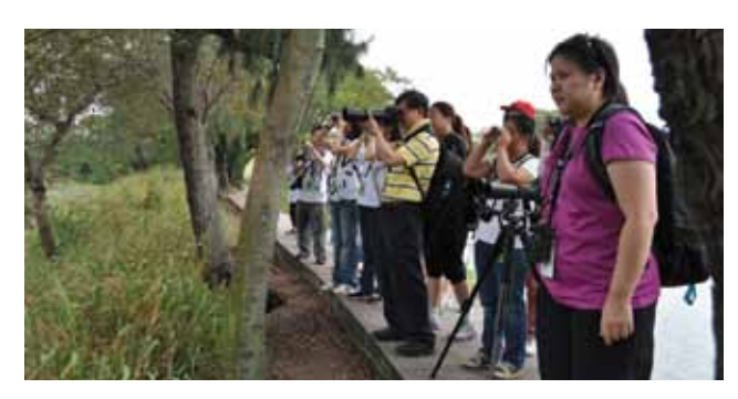
Birdwatching at Mai Po