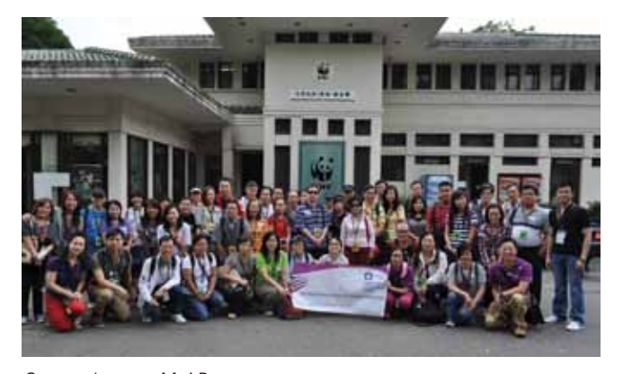
Group photo at Mai Po