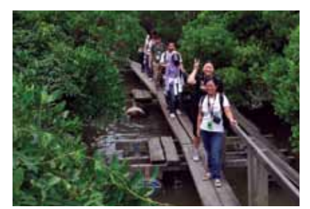
Members walking on the floating boardwalk